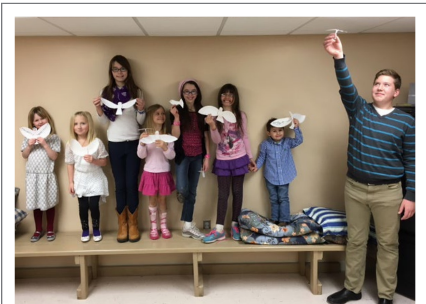
During worship, "The Littles" took part in learning about the Holy Spirit. They each created their own doves, and then flew them afterwards. ■